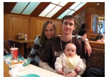
Eating Lunch at Niagara Falls